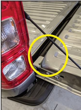
Step 6: Verify Blade Mounting Position

6 Slowly open the tailgate and make sure that it does not hit the Blade at any point.