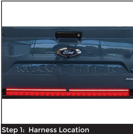
Step 1: Harness Location