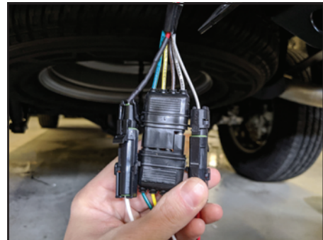
Step 6: Verify Blade Mounting Position

7 Route the wires behind the bumper. Connect 4 pin connector and Weather Pack connectors to Blade Harness. Note: Putco recommends using di-electric grease on 4 pin connector to help keep connection water resistant. Zip-tie wires and Blade driver box in safe location, away from debris, hot exhaust pipes, or pinch points.