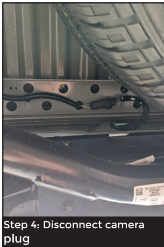
Step 4: Disconnect camera plug