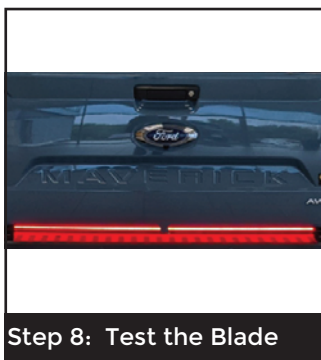
Step 8: Test the Blade

8 Route the wires behind the bumper. Connect 4 pin connector and Weather Pack connectors to Blade Harness. Note: Putco recommends using di-electric grease on 4 pin connector to help keep connection water resistant. Zip-tie wires and Blade driver box in safe location, away from debris, hot exhaust pipes, or pinch points.