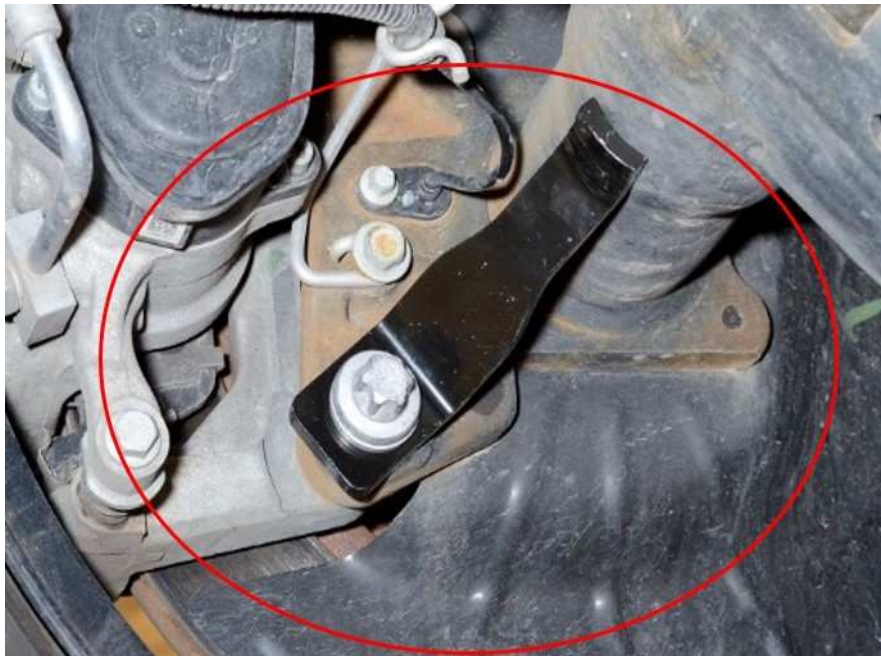
Fig. 2 One Bracket Installed into Position