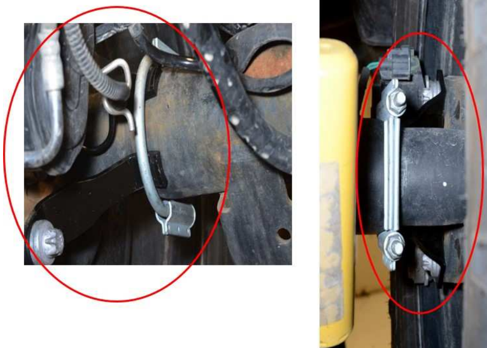
Fig. 4 Brake Brackets and U-Clamp Installed